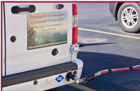
The CNG powered vans are now operational and the calculated cost is estimated in the range of $1.50 per gallon of gas equivalent.

Then, in mid 2010, the CCAAA entered into discussions with a new CNG conversion company, Alternative Fuel Solutions of PA, which began operations in Mahaffey, Clearfield County. In early 2011, the CCAAA was successful in securing a competitive “Building the Future Impact Grant”